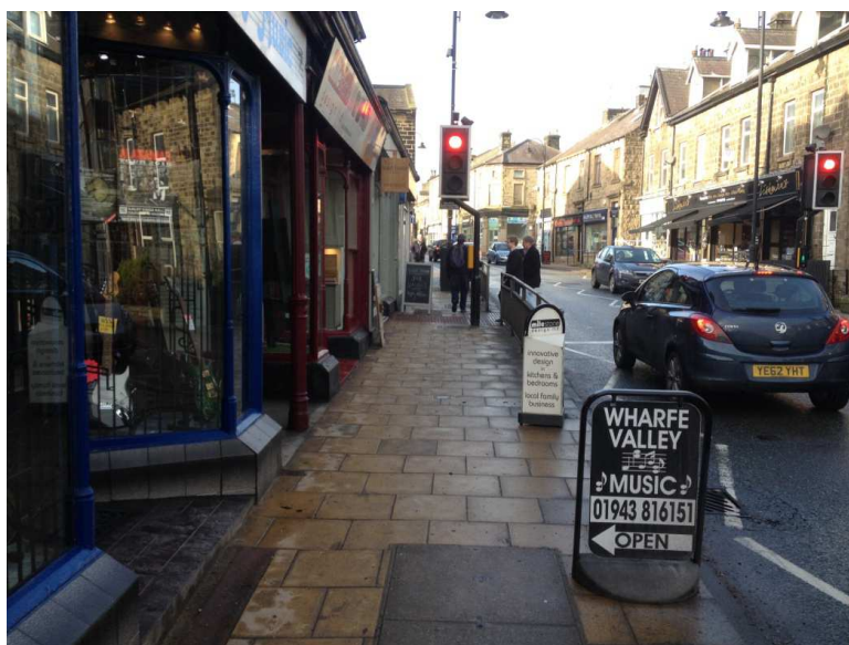
Photograph 4: Leeds Road, Ilkley