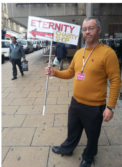
Photograph 1: Advertising alternatives