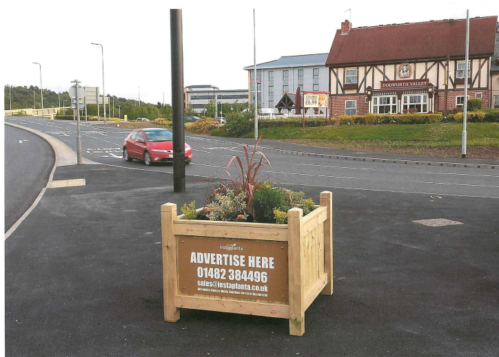
Photograph 2: A Typical Instaplanta Installation