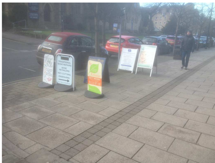
Photograph 3: The Grove, Ilkley