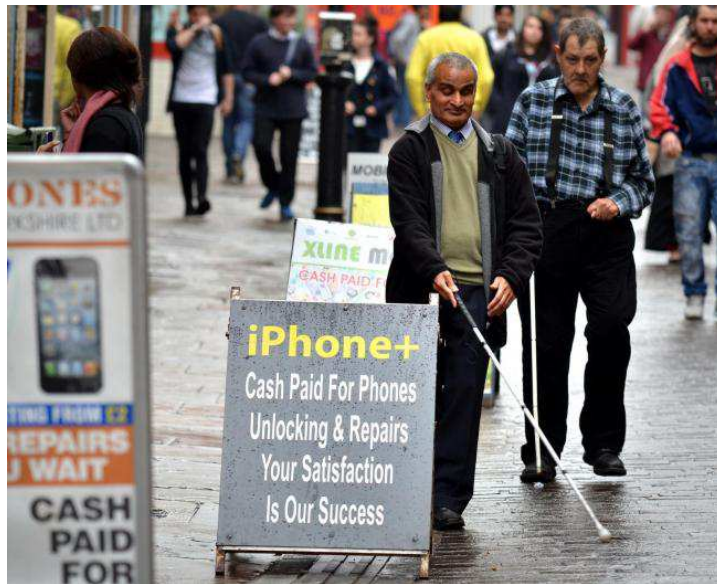
Photograph 5: Ivegate, Bradford